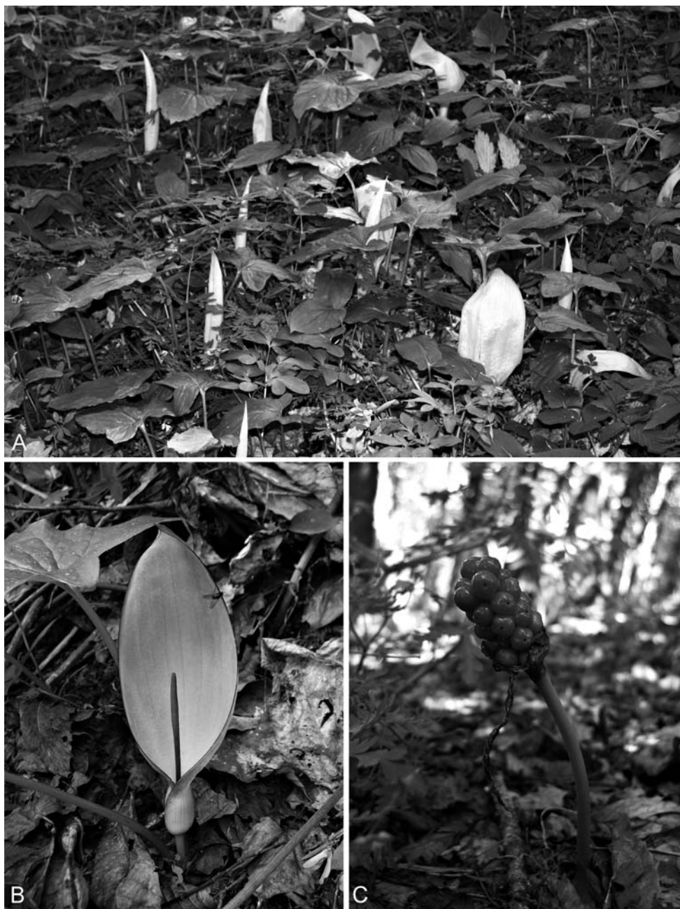
Fig. 1. Arum megobrebi in the Surami Mts, central S Georgia – A: plants in its natural habitat; B: inflorescence with possible pollinator; C: infructescence.