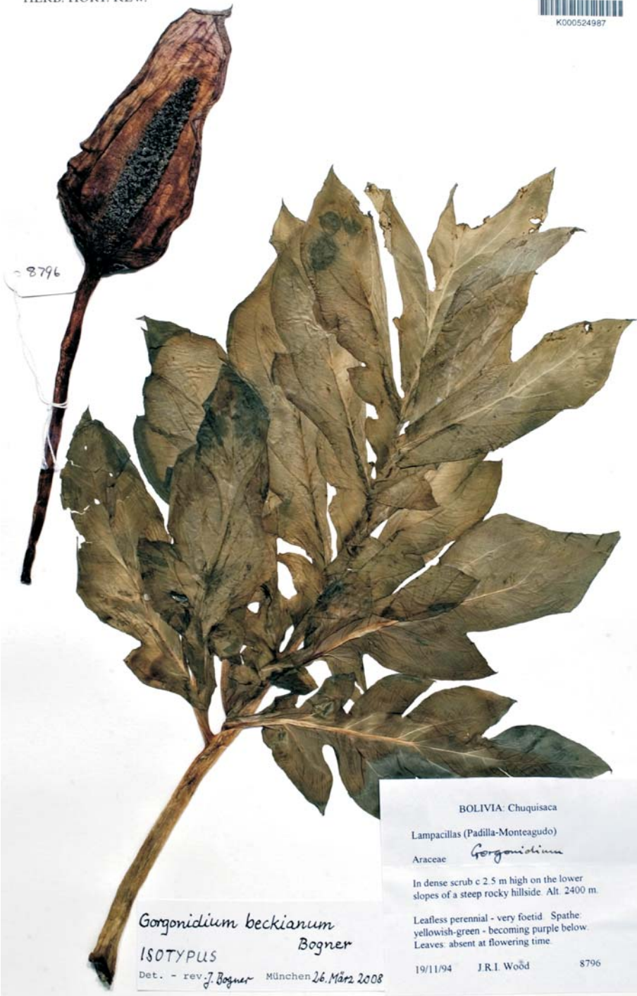
Fig. 2. Gorgonidium beckianum – isotype J. R. I. Wood 8796 at K.