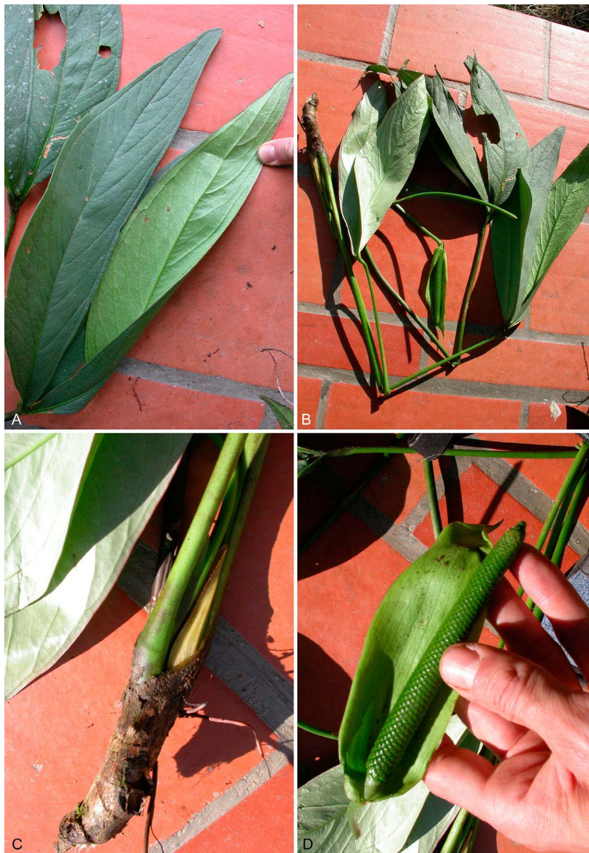
Fig. 6. Anthurium wernerii – A: leaf blade, adaxial surface; B: flowering plant detached from tree; C: stem with base of petioles and cataphylls; D: inflorescence, close-up; photographs by F. Werner of living plants from the type collection.