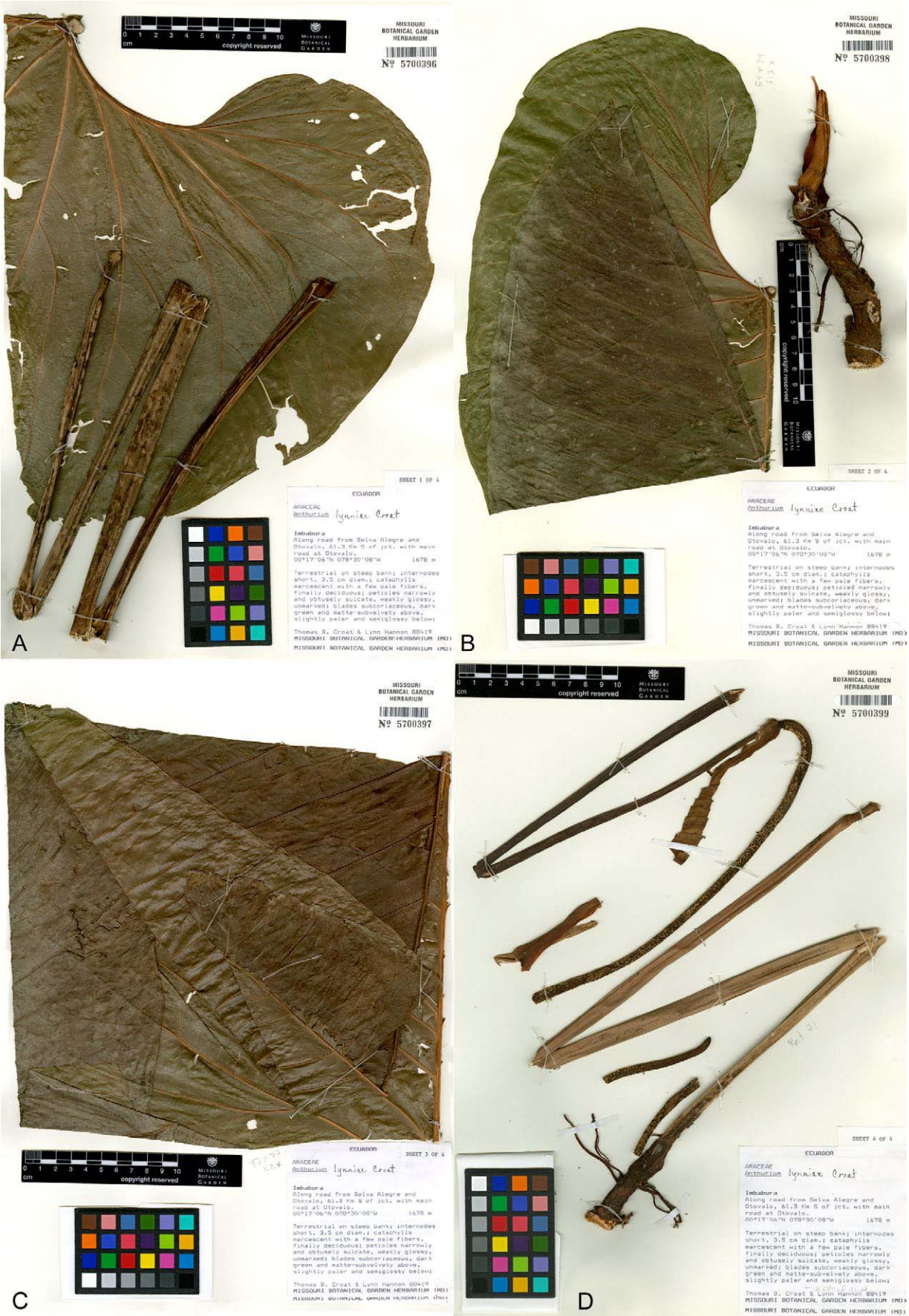
Fig. 3. Anthurium lynniae – the four sheets of the holotype at MO, Croat 88419.