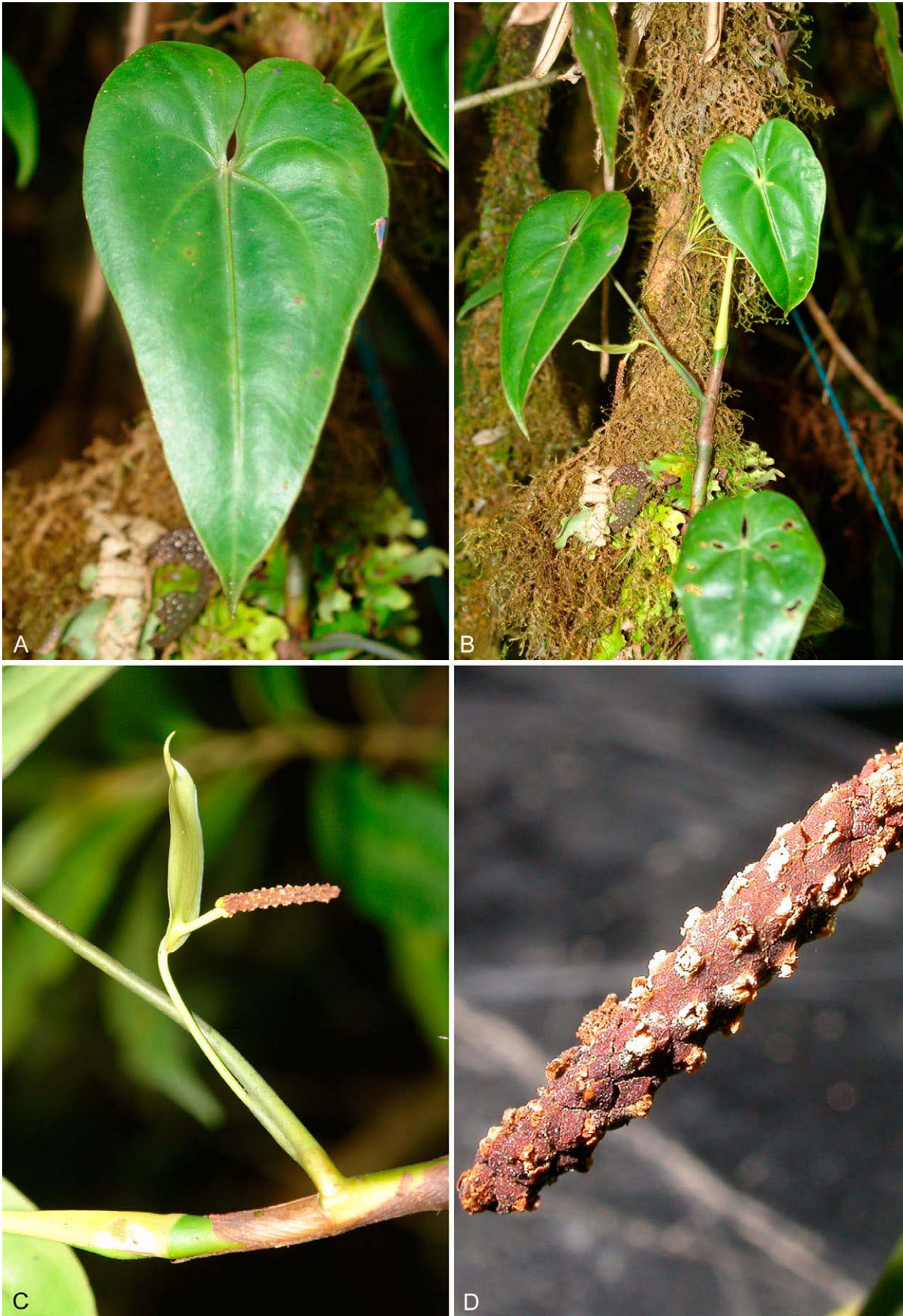
Fig. 4. Anthurium mendietae – A: leaf blade, adaxial surface; B–C: inflorescence, side view with stem; D: inflorescence, close-up. – Photographs by G. Mendieta of living plants from the type collection.