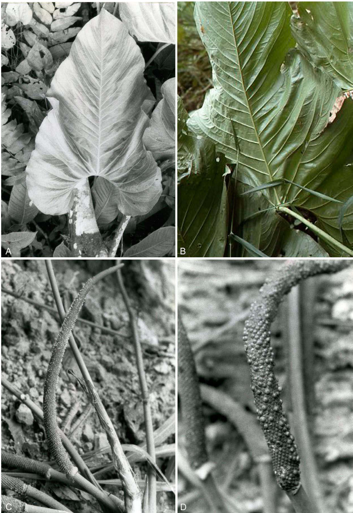
Fig. 5. Anthurium quinindense – A: leaf blade, adaxial surface; B: leaf blade, abaxial surface; C: inflorescence; D: infructescence, close-up. – Photographs by T. Croat of living plants from the type collection.