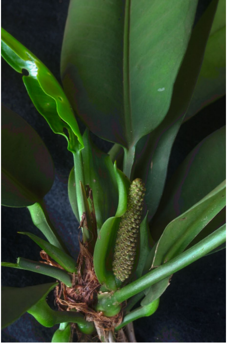
Fig. 1. Anthurium truncatum in cultivation. from the living accession vouchered as Gonçalves 2010.

50–65° angle, arcuate, slightly prominent on upper surface, raised below; secondary veins prominulous in both surfaces when dry, reticulate veins almost invisible to slightly raised below; collective vein 5–6 mm from leaf margin. Inflorescences usually pendent after anthesis, much shorter than the leaves; peduncle 1–2 cm long, 0.5–0.7 cm diam., 2–4 × shorter than the petioles; spathe erect, chartaceous, ovate, semimatte medium green outside, concolorous or a little glaucous inside, densely white-speckled on both surfaces when fresh, 3–5 × 1.5–2.5 cm, broadest near the base, sometimes almost at middle, inserted at 45° angle on the peduncle, cuspidate to acuminate at apex, obtuse at base, spathe margins meeting obtusely to almost at 180°; spadix greenish to greyish green, stipitate for 4–5 mm, tapered, 2.6–4 cm long, 0.6–1 cm diam. at base, 3–5 mm diam. at apex, broadest near base; flowers rhomboidal, 3–3.5 mm long, 2.8–3 mm wide; 7–8 flowers visible in principal spiral, 5–6 flowers visible in alternate spiral; tepals matte, lateral tepals 0.9–1 mm wide, inner margins straight, the outer margins 2-sided; pistils emergent, stigma rounded; stamens not covering the stigma at all, filaments not exerted, anthers 0.5–0.7 × 0.4–0.6 mm, thecae ovoid, 0.5–0.7 × 0.2–0.3 mm. Infructescence unknown.