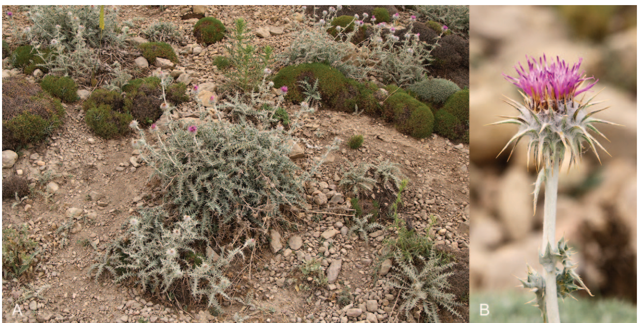
Fig. 2. Cousinia saloukensis at its type locality – A: mature individuals along with young plants; B: flowering head.

Systematic affinities — Morphologically Cousinia saloukensis is most similar to C. polyneura Rech. f. of C. sect. Eriocousinia from eastern Afghanistan. This lat-