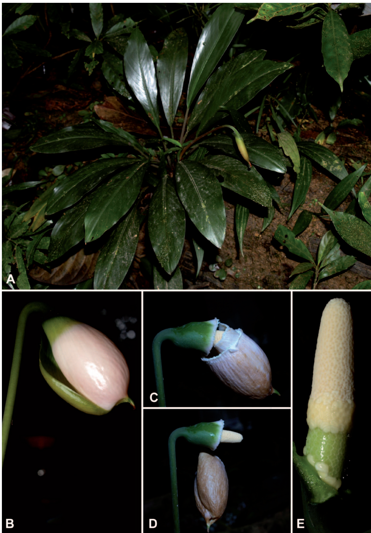
Fig. 2. Piptospatha burbridgei – A: flowering plant in habitat, on shales, Mulu N. P., N. Sarawak; B: inflorescence at pistillate anthesis; C: inflorescence at onset of staminate anthesis. Note that the spathe limb has begun to senesce and has partly separated from the lower, persistent spathe; D: inflorescence towards end of staminate anthesis; E: spadix (spathe artificially removed) at pistillate anthesis.