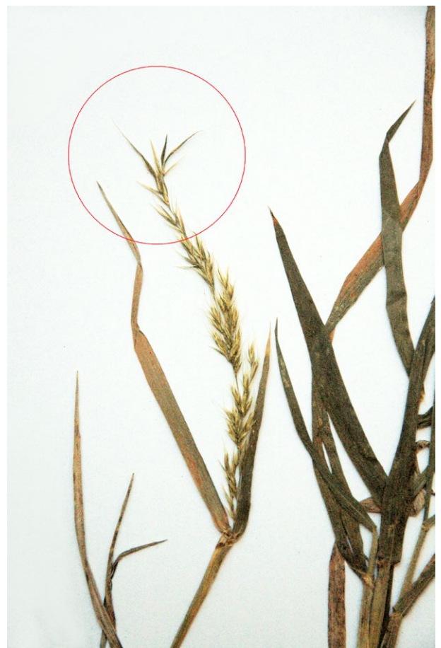
Fig. 4. Trisetum tamonanteae – panicle with a proliferated spikelet (‘‘plantlet’’), as a possible pseudoviviparous mechanism. – Paratype: A. Marrero (LPA 24805).

In the Poaceae pseudoviviparism has been recorded for at least 41 species in 13 genera (Pierce & al. 2003). It has been described for genera such as Dactylis L., Deschampsia P. Beauv., Digitaria Haller, Festuca L., Poa L., and Polypogon Desf., among others (Vega & Rúgolo de Agrasar 2006). The pseudoviviparism mechanism is generally associated with boreal or alpine species exposed to strong stress in nutrient-poor habitats (Elmqvist & Cox 1996; Pierce & al. 2003). The possible tendency to vegetative propagation by pseudoviviparism in T. tamonanteae