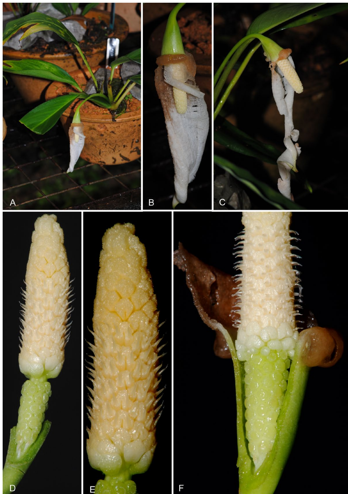
Fig. 3. Aridarum unicum – A: cultivated plant with inflorescence at staminate anthesis; note the pendent inflorescence, and the disintegrating spathe limb; B & C: inflorescence at staminate anthesis; D: spadix (spathe artificially removed) at end of pistillate anthesis; note that the interstaminal staminodes have yet to expand, and that the thecae horns are directed upwards; E: detail of appendix, staminate zone, and interstice staminodes; F: inflorescence at late staminate anthesis, with the lower spathe artificially removed; note the deliquescent remnants of the spathe limb, that the thecae horns have reflexed, many with a droplet at the tip, and that the interstice staminodes have expanded laterally.