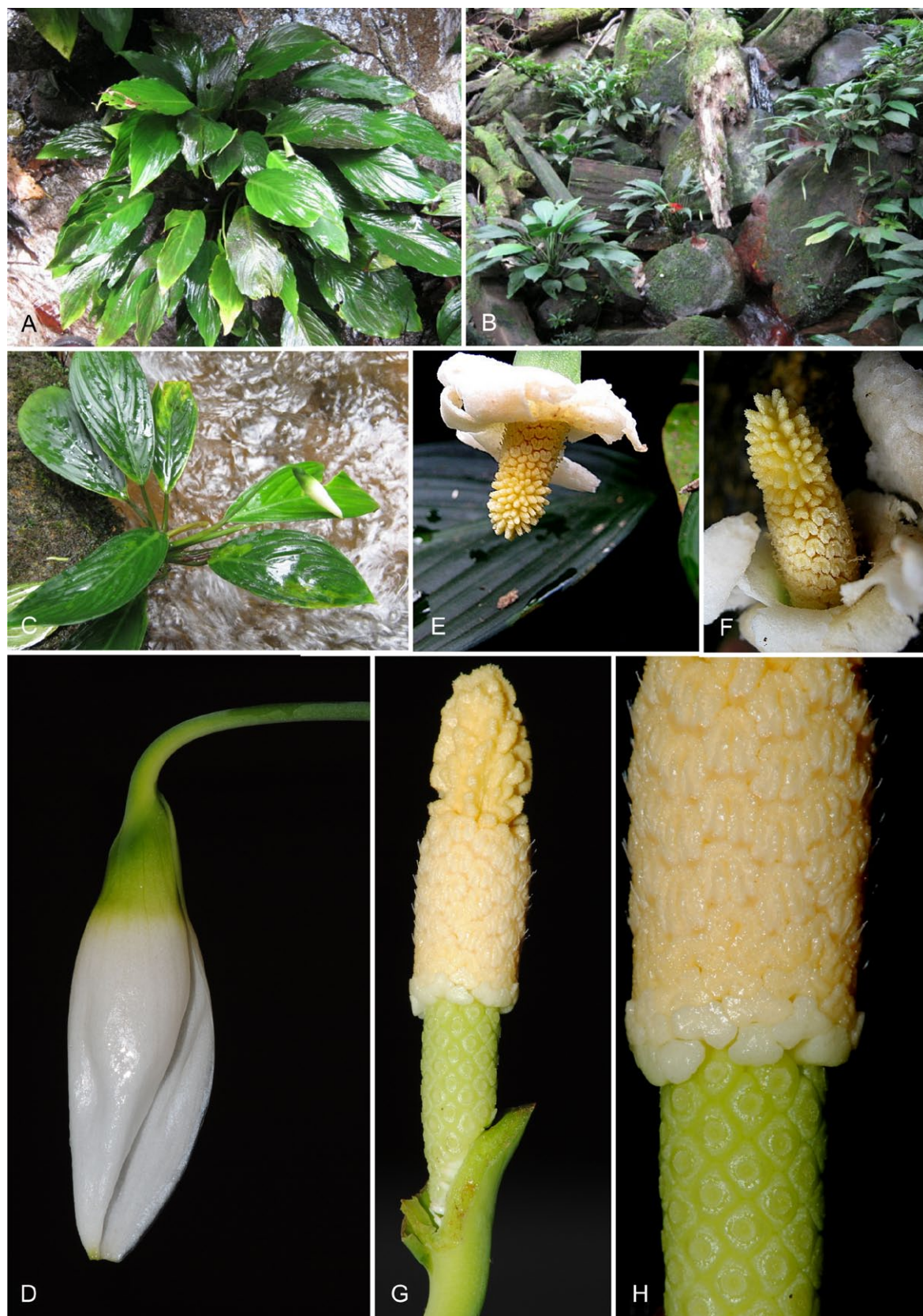
Fig. 2. Aridarum rostratum – A–C: plants in habitat; note the pendent inflorescences visible (B, centre and mid right); D: inflorescence at early pistillate anthesis; E & F: inflorescence at staminate anthesis; note that with the majority of the spathe limb is already shed; G: spadix (spathe artificially removed) at onset of staminate anthesis; H: detail of spadix fertile zones at onset of staminate anthesis; note that the interpistillar staminodes are beginning to expand laterally. – Photograph A from K. Nakamoto AR-3538; B–H from K. Nakamoto AR-3532; A–F by K. Nakamoto; G and H by P. C. Boyce.