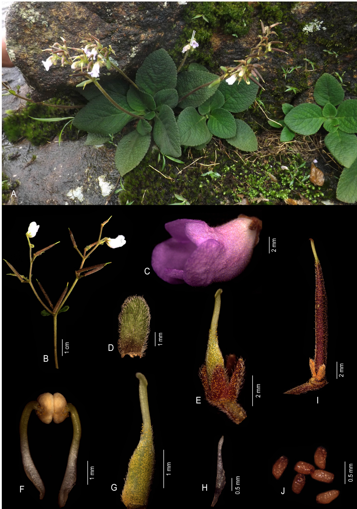
Fig. 1. Henckelia bracteata – A: plants in natural habitat; B: scape showing branching pattern and bracts; C: flower, just opened; D: bract; E: calyx enclosing gynoecium; note calyx reaches c. \frac{1}{2} length of ovary; F: stamens with cohering anthers; G: gynoecium; H: staminode; I: capsule; note reddish brown colour of calyx and capsule (yellow spots on fruit and sepals are pollen grains); J: seeds. – A: type locality, 7 Aug 2014; B–J from A. P. Janeesha & Santhosh Nampy 134270.