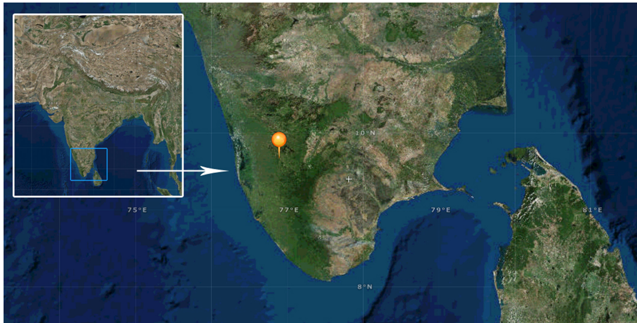
Fig. 3. Henckelia bracteata – type locality (extent of currently known distribution).

Burtt in the shape of its leaves, the presence of bracts, and in having scapes much longer than the leaves, but is readily distinguished by its cymes having a greater number of flowers (14–38), its large elliptic to obovate bracts, ovate calyx lobes, and the presence of eglandular trichomes at the junction of the anther lobes and filaments.