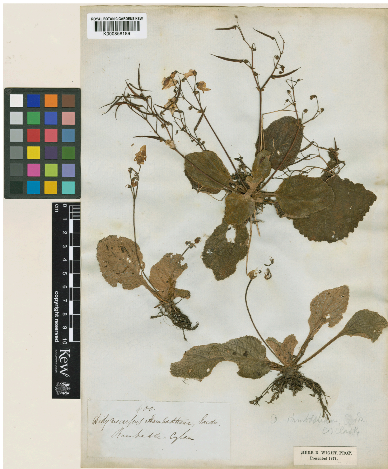
Fig. 5. Lectotype specimen of Didymocarpus humboldtianus ( \equiv Henckelia humboldtiana): Gardner 600 (K000858189). Reproduced with the consent of the Royal Botanic Gardens, Kew.

Remarks — Henckelia bracteata is robust and dull green, with the peduncle, pedicel, calyx and capsules generally reddish brown. Although the margin of the leaf blade is crenate, the crenation is shallow when compared to the similar H. humboldtiana , which is distributed in S India and Sri Lanka. The corolla is pale lilac with a yellow blotch at the throat in its natural habitat, but in cultivation in the