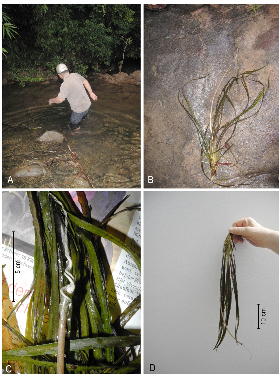
Fig. 2. Cryptocoryne crispatula var. tonkinensis – A: pool shown in Fig. 1C with large patch of submerged plants being sampled; B: extracted plant lying beside pool; C: spathe showing spirally coiled limb with purple line-like markings; D: sampled plant showing long flaccid leaves and long spathe exceeding leaves in length.

The original description of Cryptocoryne tonkinensis by Gagnepain (1941) is based on three herbarium gatherings from Vietnam: “Rive droite de la rivière Noire, en aval de Ben-heu”, 29 Nov 1887, Balansa 2043 (L0041882, L0041883, P00461144, P00461145, P00461146, P00461147); “Vallée de Baa-tai, à la base du Mont Bavi” [present-day Mt Ba Vi], 8 Feb 1887, Balansa 2044 (L0041884, L0041885, P00461140, P00461141, P00461142, P00461143); and “Vallée de Baa-tai (Mont-Bavi)”, Aug 1887, Balansa 2045 (P00509483). The specimens in L can be seen at http://vstbol.leidenuniv.nl/NHN/Explore and those in P can be seen at https://science.mnhn.fr/institution/mnhn/collection/p/item/search/form .