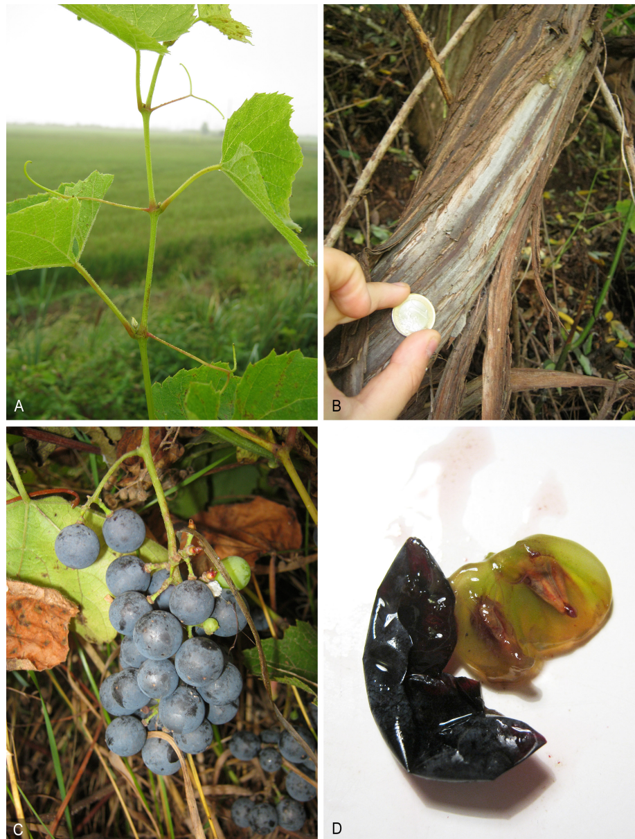
Fig. 4. Vitis x novae-angliae additional morphological traits – A: continuous tendrils; B: stem and exfoliating bark; C: infructescence and pedicels with characteristic residuals of red mesocarp after detachment of berries; D: berry with mucilaginous mesocarp clearly separating from exocarp. – A, C, D: Albuzzano, Italy; B: Bereguardo (Moriano), Italy.

According to Moore (1991), the native range of Vitis x novae-angliae comprises the states of New England (NE United States), where it was described by Fernald (1917). However, its occurrence in further sites where the ranges of V. labrusca and V. riparia overlap is possible, as