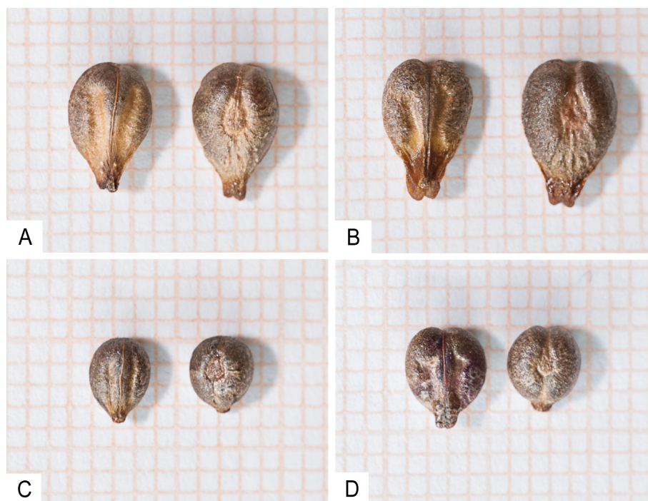
Fig. 3. Vitis \times novae-angliae , V. labrusca , V. riparia and V. koberi seeds, ventral (on left) and dorsal (on right) sides, on 1 mm squared paper – A: V. novae-angliae (Albuzzano, Italy); B: V. labrusca (Pavia, Italy); C: V. riparia (Portalbera, Italy); D: V. koberi (Montù Beccaria, Italy). – Photographs by C. Ballerini.

according to their terminology) hybrids that originated in natural habitats of E North America (states of New York and Tennessee, respectively, see Hedrick 1908), then discovered and transferred into cultivation during the first half of the 19 th century (to serve also as a basis for the selection of the other cultivars). However, artificial crossing between V. labrusca and V. riparia is likely to have occurred in European nurseries, as stated by Viala & Ravaz (1892), who excluded a direct employment of American “hybrides sauvages” in France, being of little viticultural interest.