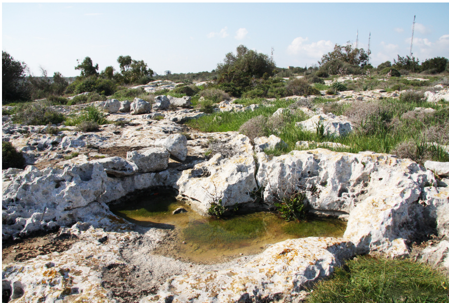
Fig. 4. Cupular pool supporting Callitriche pulchra . – Cyprus, Protaras, Fanos, 16 Feb 2014, photograph by Kyriakos Kefalas.

until 2014, when populations were found on Cyprus (Fig. 2). The species is now known to occur at seven locations in the E part of Cyprus, mostly in the Kokkinochoria area and rarely in the E part of the Mesaoria plain (phytogeographical divisions 4 and 5). It was first discovered in 2011 by KK at Fanos hill near Paralimni and collected there in 2014. Subsequently, extensive surveys in January–February 2016 located another six populations, as follows: Division 4: Fanos, Protaras, rock pools, 160 m, 16 Feb 2014 & 19 Feb 2016, Kefalas 6174 & 6555 (CYP) (Fig. 4); Kavallos, Frenaros, rock pools, 60 m, 8 Jan 2016 & 15 Feb 2016, Kefalas 6511 & 6547 (CYP); Between Agia Napa and Cape Greko, rock pools, 50 m, 13 Jan 2016,