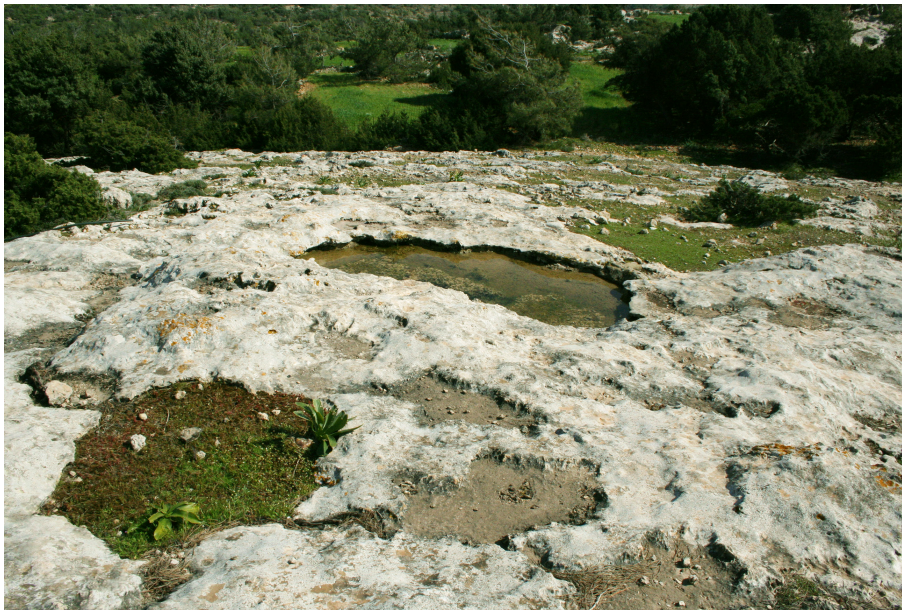
Fig. 3. Cupular pool complex supporting Callitriche pulchra . – Greece, Gavdos, Agios Pan-teimonas, 20 Mar 2015, photograph by Richard V. Lansdown.