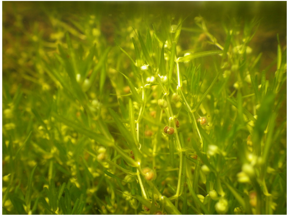
Fig. 5. Callitriche pulchra , fruiting plant. – Greece, Gavdos, Agios Ioannis, 22 Mar 2015, photograph by Richard V. Lansdown.

lantii ; C. vaillantii ; C. vaillantii – Polypogon maritimus Willd.; and Crassula alata (Viv.) A. Berger – Crepis pusilla (Sommier) Merxm. (Bergmeier 2001; Vogiatzakis & al. 2009). Callitriche pulchra is listed as a characteristic component of two of the deeper pool types in association with other species that can only survive completely submerged.