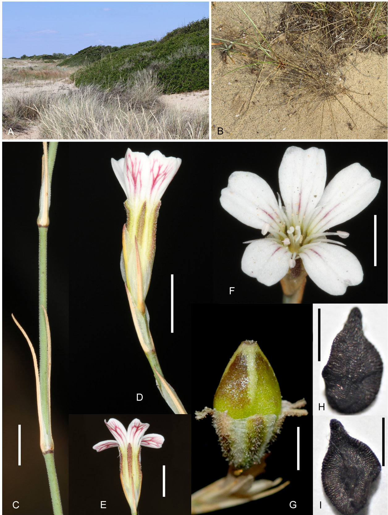
Fig. 2. Petrorhagia laconica – A: sand-dune habitat NW of Neapoli village in SE Peloponnisos with evergreen shrubs (locus classicus), 22 May 2017; B: individual with simple, procumbent-ascending stems at the locus classicus, 16 May 2014; C: middle part of stem with leaves; D: upper part of stem with flower; E: flower, lateral view; F: flower, apical view; G: immature capsule; H: seed, dorsal face; I: seed, ventral face. – Scale bars: C–F: 3 mm; G: 1 mm; H, I: 500 \mu m. – All photographs by Panayiotis Trigas except G by Eleftherios Kalpoutzakis.