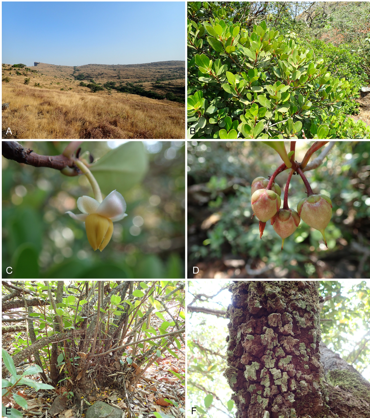
Fig. 2. Ternstroemia guineensis – A: habitat, submontane gallery forest in sparsely wooded grassland; B: habit; C: flower; D: fruits; E: base of a multi-stemmed shrub; F: bark of a tree, trunk c. 18 cm in diam. – Photos: Republic of Guinea, Kounounkan Massif, Feb 2019, Xander van der Burgt.

concave, thick, leathery, outer surface wrinkled when dry, unequal, outer pair suborbicular, c. 4.5 \times 5.2 mm, leathery, margin scarious, 0.5–1 mm wide, erose, apex rounded or retuse, sometimes with mucro 0.3–0.4 mm long, inserted adaxially below margin; inner sepals ovate, c. 6.5 \times 6 mm, mucro absent, margin as outer sepals. Petals 5(or 6), yellow or yellowish white, together forming a short cylinder enclosing stamens, petals imbricate, connate in basal \frac{1}{4} (for 1.7–2 mm, Fig. 1F, 2C), each nar-