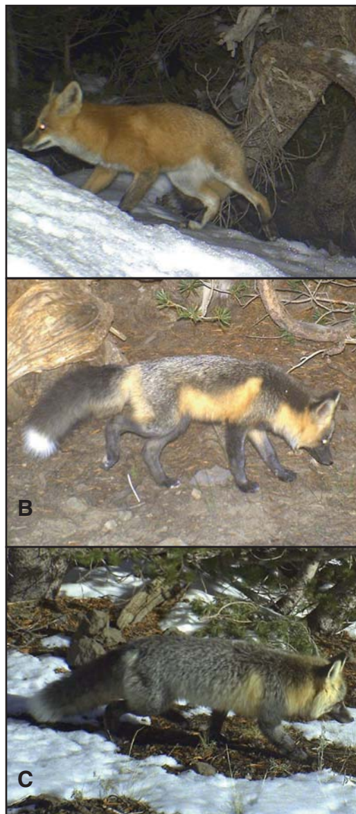
Figure 2. Red fox photographs taken near the Sonora Pass using remote digital camera stations: A) red-pelage individual photographed at 2326 hrs on 8 October 2010, B) cross-pelage individual photographed at 0105 hrs on 7 September 2010, and C) cross-pelage individual photographed at 1315 hrs on 31 October 2010.

the Sierra Nevada red fox (Table 3). Haplotype J-34, which is one cytochrome b base-substitution from C-34, was found in 3 museum samples from the Sierra Nevada. A single museum specimen