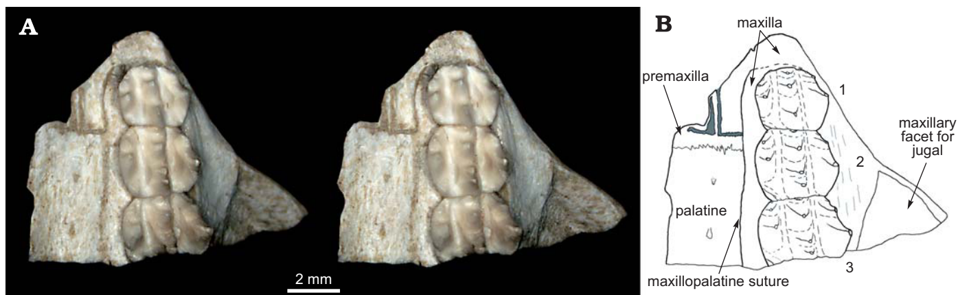
Fig. 1. Tritylodontid cynodont Yuanotherium minor gen. et sp. nov. from the upper part of the Shishugou Formation (Oxfordian, Late Jurassic), Junggar Basin, northwestern Xinjiang, China. IVPP V15335 (holotype), fragment of upper jaw and three anterior postcanines in occlusal view. Stereo pair (A) and explanatory drawing (B). 1–3, the first, second and third left upper postcanines.