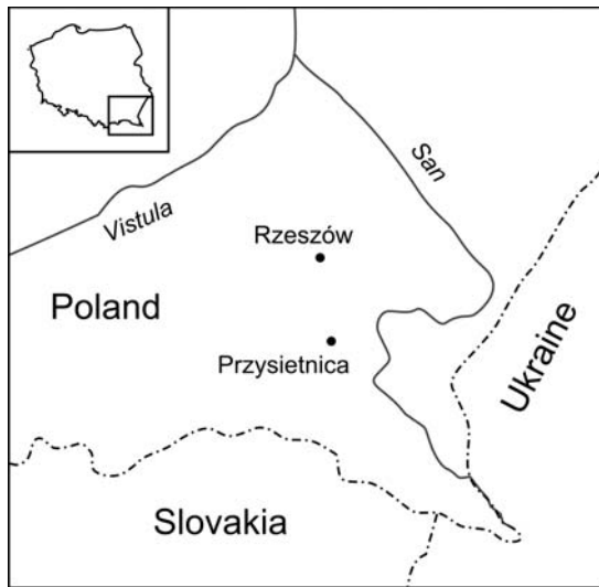
Fig. 1. Location of the village of Przysietnica in southeastern Poland, where the specimen ZPALWr. A/4004 was found.

dicating the IPM4A Zone (Kotlarczyk et al. 2006: fig. 6). The fossiliferous horizon of Przysietnica (PS-5) has been dated to Rupelian, early Oligocene, circa 29 Mya, on the basis of the fish assemblage indicating the IPM4A Zone, and correlated with the calcareous nannoplankton of the NP24 Zone sensu Berggren et al. (1995). The fossil-bearing section at Przysietnica is currently referred to the Šitbořice Member of the Subsilesian Unit of the Menilite Formation of the Polish Outer Carpathians (Kotlarczyk et al. 2006: 16, 96).