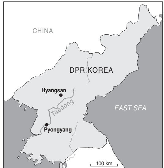
Figure 1. Survey sites during 1999–2004 were located in Pyongyang (Diplomatic Compound, Moran-bong Park, Munsu-bong Park, Taedong-gang) and Hyangsan (including the Myohyang mountains).

Birds were surveyed through direct field observation at several sites (Fig. 1) between April 1999 and November 2004, the intensity increasing until 2003 (number of days with at least several hours of observation: 14 in 1999; 60 in 2000; 137 plus two from R.J. Tizard in 2001; 219 plus 13 in 2002; 247 in 2003; and 52 in 2004). In Pyongyang, observations were spread in all weeks of the year, and in Hyangsan in most weeks, excepting some of January and August and most of February. Standardised routes were followed each day at Moran, Munsu and Hyangsan, allowing comparison of counts between days within each site; but routes varied along the Taedong. Myohyang was visited less regularly, but multi-day forays deep into the protected area, across its entire altitudinal range (100–1909 m), were spread across the breeding season. Chief characteristics of each site are given in Duckworth (2006: Table 1). Arctic Warbler is very similar in plumage to Greenish Warbler P. trochiloides plumbeitarsus (Beaman & Madge 1998), a locally common breeder in Myohyang's higher altitudes, and rare passage migrant through Pyongyang (own data). Silent birds may elude certain identification, but song and calls allow easy identification (e.g. Lekagul &