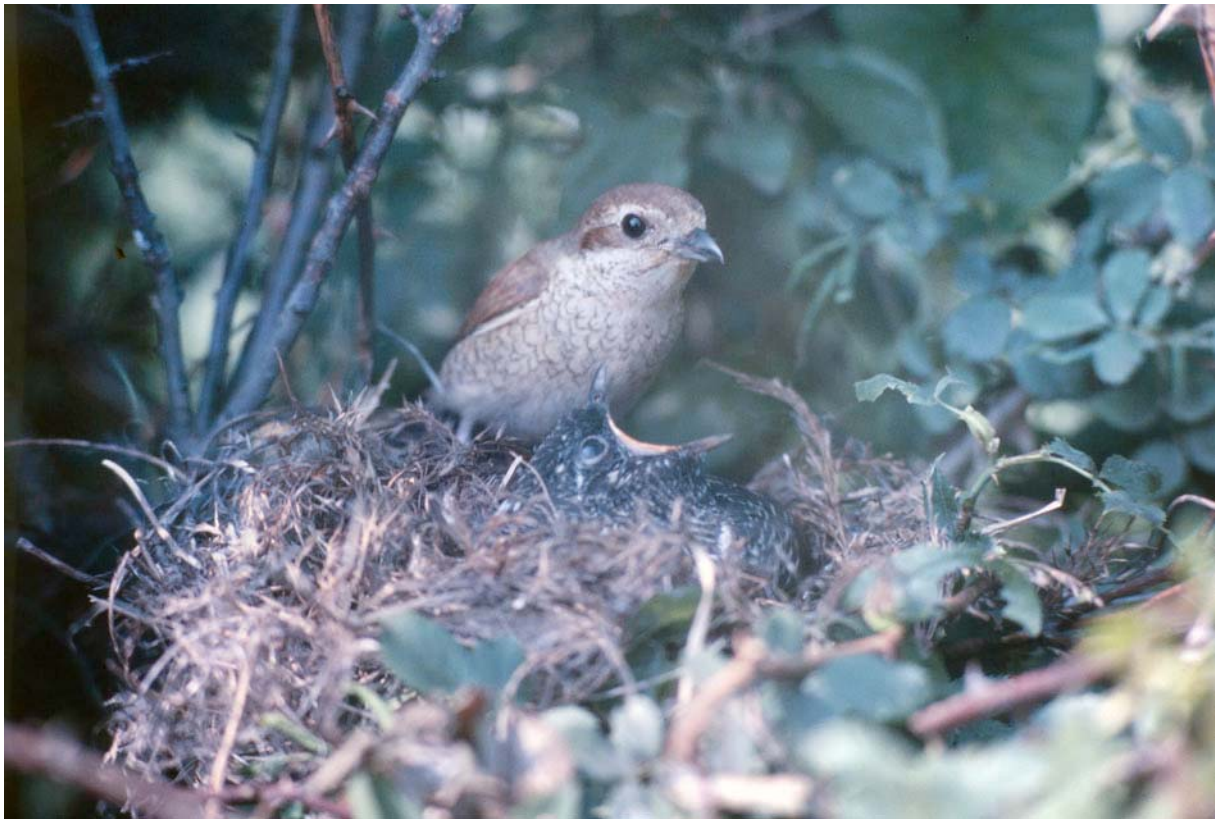
Figure 3. A young Common Cuckoo fostered by a Red-backed Shrike, 28 June 1985, Břeclav, Southern Moravia.

successful parasitism by the Cuckoo. Another explanation for the drop in parasitism is a decline of host numbers as explained below.