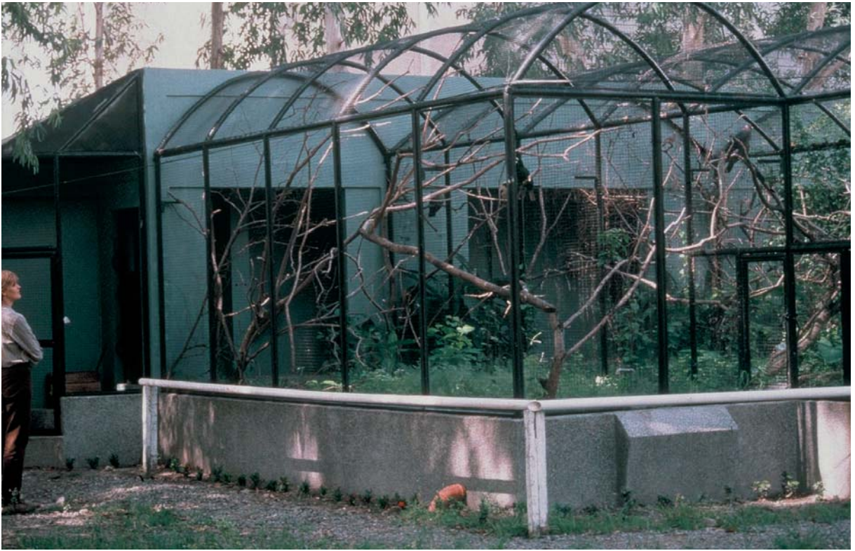
Figure 5. Breeding aviaries for Philippine Eagle Owls, sponsored by the World Owl Trust. NFEFI-Biodiversity Conservation Centre, Bacalod, Negros Occidental, Philippines.

must also have been eliminated. For instance, one of the most serious problems facing almost all of the Philippine owls is the lack of nesting holes due to the disappearance of large trees. In the face of continuing habitat loss and virtually non-existent protection, it therefore seemed prudent to set up in situ conservation-breeding programmes for endangered owls to at least safeguard some of the endangered species/subspecies and create opportunities for Filipino nationals and ourselves to learn more about them and hopefully provide us with the knowledge we can use to help them in the wild. The first difficulty lay in finding a centre which could be open to local people in order to encourage their interest and education. Unfortunately, most existing Philippine zoos and 'rescue centres' were at that time far from ideal for a variety of reasons, and in the end we chose to forge links with, and support, the Biodiversity Conservation Centre created in 1977 by the Negros Forests & Ecological Foundation at Bacalod, Negros Occidental (NFEFI-BCC) (Fig. 5). The objective was to develop a world-class conservation, research and educational centre with the aim to conserve the depleted populations of endemic species found only on