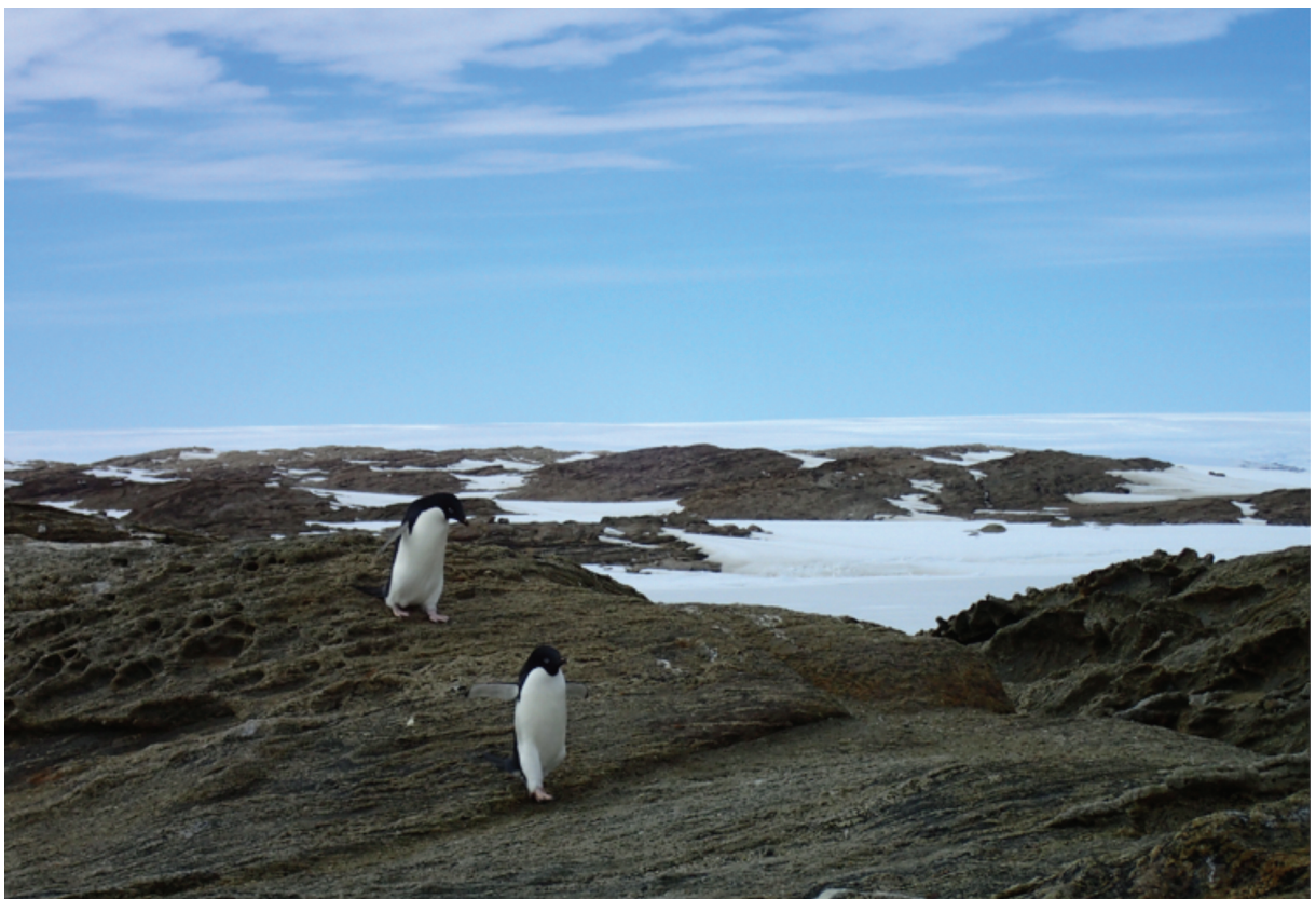
Adélie Penguins walking overland (12 December 2017, near a breeding colony in Lützow-Holm Bay in Antarctica).

Field experiments on Adélie Penguins were conducted on 17 January 2018 at the Hukuro Cove colony (Figure 1; 69.21°S, 39.63°E; 150–200 pairs) in Lützow-Holm Bay in Antarctica. This field site is about 23 km south of the Japanese Syowa (Showa) Station. Two Adélie Penguins breeding at this colony were caught by hand during the late guarding stage, during which one parent guards its chick at the nest, while the other forages at sea. Both nests had one chick. We caught the two birds just after they returned to their nest at the end of a foraging trip and before their mates left the nest to forage, thereby avoiding leaving the chick alone. The experimental birds were determined to be a