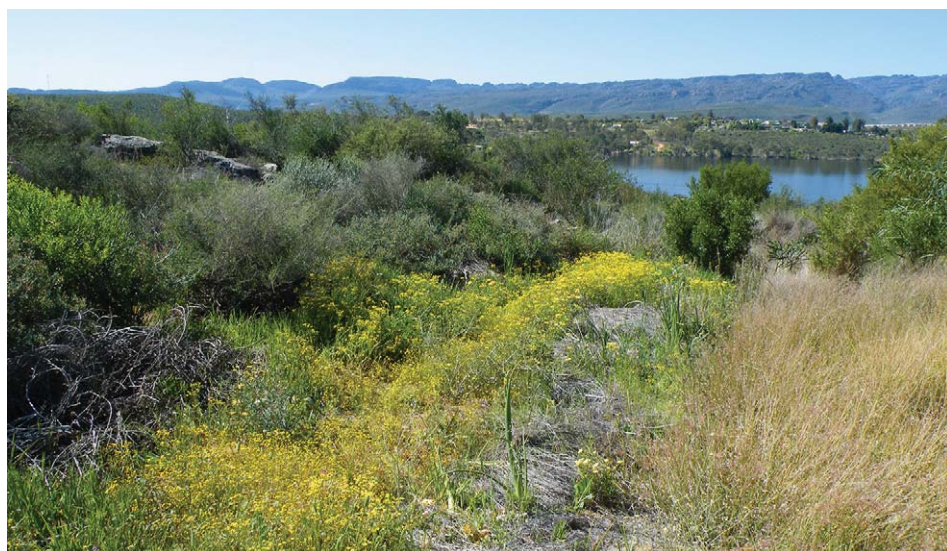
Fig. 11. Site at which the holotype of Akatiomyia eremnos gen. et sp. n. was collected (note Clanwilliam Dam in background).

Distribution, phenology and biology: Despite the apparently conflicting label data, all three specimens were captured at the same locality which is c. 4 km from Clanwilliam by road and 2.5 km as the crow flies. I collected all three specimens in an area of indigenous vegetation located behind a small development called the Cedar Inn which overlooks the Clanwilliam Dam. The two collecting episodes, one early in September, the other at the end of August, indicate that the species flies during spring. The locality is situated on the lower slopes of a hilly area known as the Uitkomsberge which reaches altitudes of only about 250 m. The area has rocky outcrops separated by sandy areas and boasts a wide variety of plant species. Figure 11 shows the exact spot where the holotype was collected as it perched at the end of a twig. Morphologically the species appears to be similar to species of Afroholopogon , Oligopogon and Rhabdogaster and so it is tempting to believe that its biology may also be similar to species allocated to these genera.