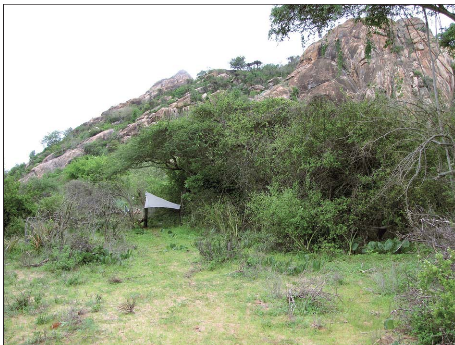
Fig. 11. The Malaise trap set at the foot of Ukasi Hill, where the type series of Hermannomyia ukasi sp. n. was collected.

Holotype: ♂ 'KENYA, Eastern Prov. / base of Ukasi Hill / 613 m. 0.82103°S. / 38.54443°E [0°49'S 38°33'E]', 'Malaise trap. Acacia / Commiphora savanna / 21 NOV-5 DEC 2011 / R. Copeland' (NMKE).