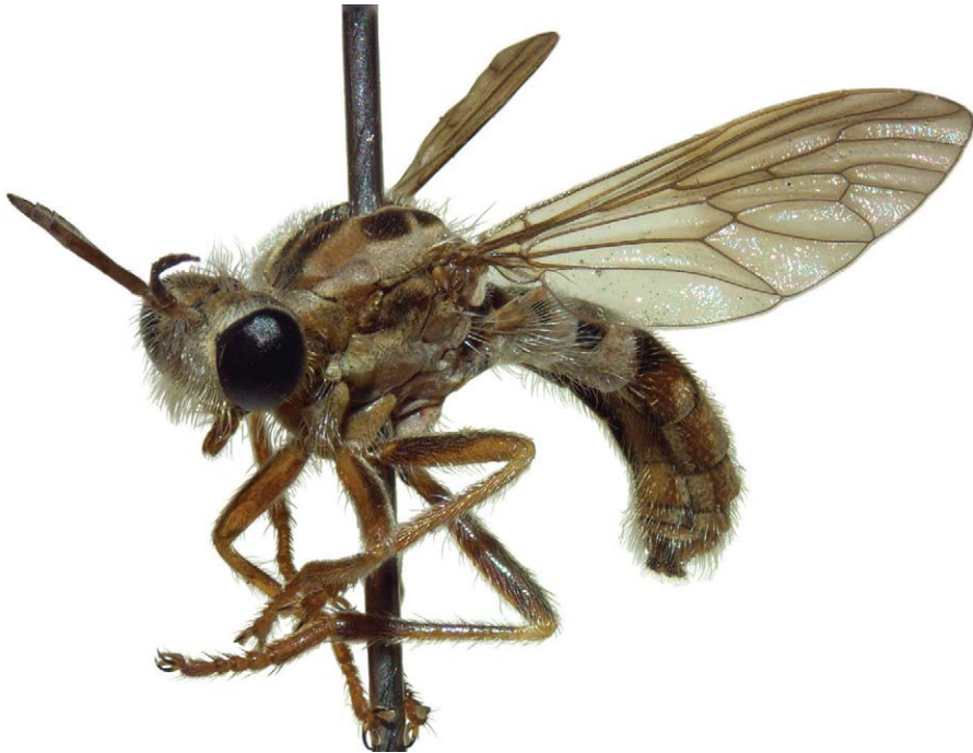
Fig. 1. Hermannomyia engeli (Hull, 1962), entire male.

The material listed for H. engeli and H. oldroydi (alphabetically according to country and in order of latitude) relates both to specimens previously recorded in the literature (as indicated at the end of those records) and specimens recorded for the first time.