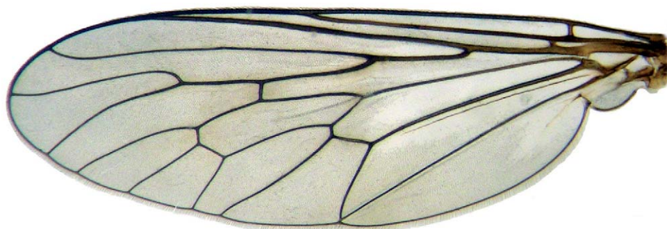
Fig. 10. Hermannomyia ukasi sp. n., left wing of paratype male.

Legs: Coxae blackish, strongly silver pruinose, white setose. Trochanters brown-yellow. Femora brown-yellow, darker brown dorsodistally. Tibiae and tarsi dark red-brown to blackish. Claws, pulvilli and empodia well-developed (metathoracic empodia border on being inflated and laterally compressed as seen in Empodiodes Oldroyd, 1972).