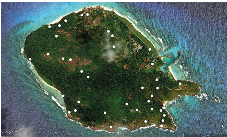
Fig 1. Map of Frégate Island, sampling sites indicated by white dots (adapted from Google Earth, DigitalGlobe map data 2015).

Field sampling sites were determined by initially conducting a repeatable pilot study. The island (Fig. 1) was divided into habitat types based on the vegetation map of Henriette and Rocamora (2009) and was searched for the presence of burrows. Vegetation types are clearly distinguishable as a result of large-scale anthropogenically induced vegetation changes. Ground truthing determined the precise location of these various habitats. In each described habitat an extensive search was conducted between the beginning of February and the end of March 2010 on three separate occasions. Leaf litter was searched through, rocks and logs were overturned and replaced, and all other litter was searched to find burrows. This allowed for the determination of habitats in