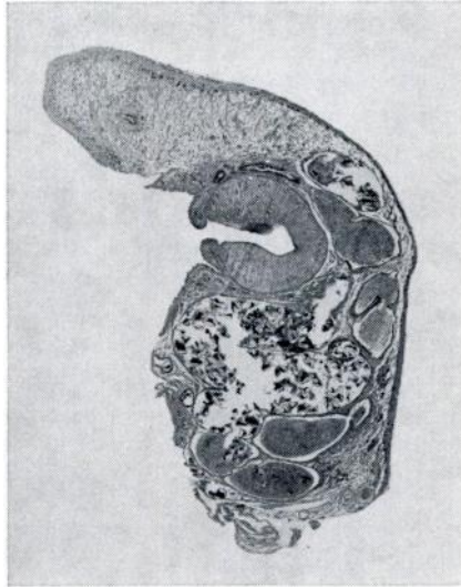
FIGURE 1. Section of adult trematode taken from the round window of the cochlea of a dolphin (X35).

tory system and acoustic behavior of dolphins and whales should be aware of the possibility that parasites could contribute to loss of hearing and thus affect the accuracy of accumulated data.