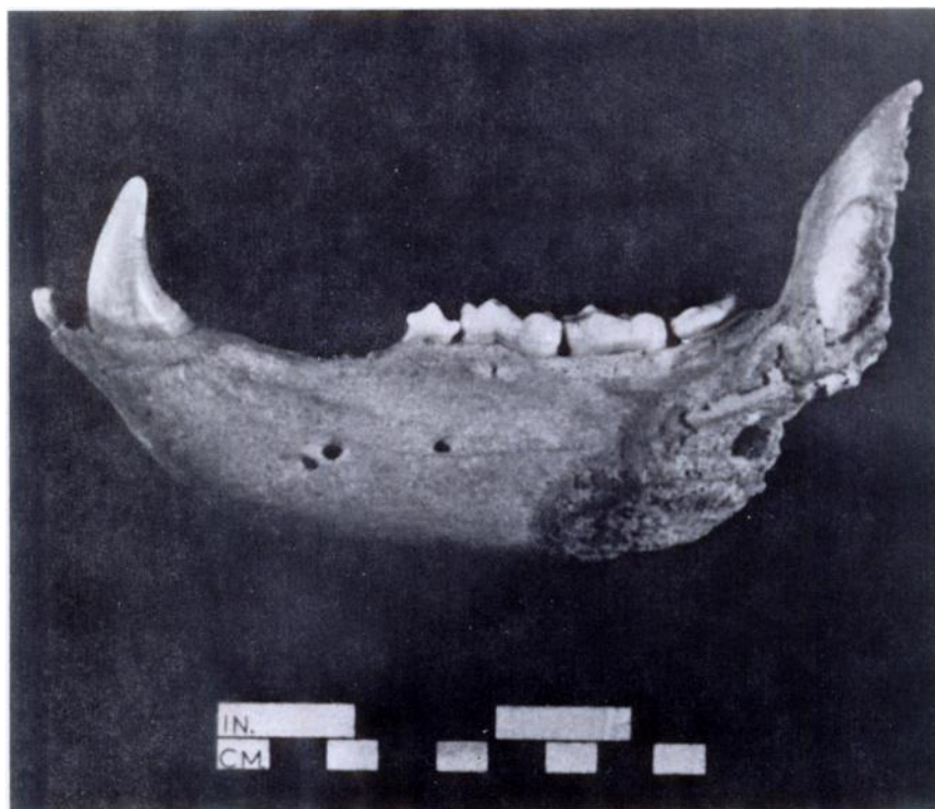
FIGURE 1. Lateral view of injured left mandible of Ursus americanus showing proliferation characteristic of healing bordering the missing area.

new woven bone is a characteristic response to osteomyelitis, and can be similar to proliferation during healing, the bony buildup in this specimen was determined to be normal callous formation associated with healing. The following characteristics indicate that no major bacterial bone infection was present: the localized foci of proliferation, no change in the temporomandibular joint, thus no spread of infection; no loosening of previously healthy teeth, a sign of spreading osteomyelitis; 1 the mental foramina are not enlarged, which would indicate hypervascularity to an infected site; no lytic bone is present; and no sequestra had formed (Dr. Owen Lovejoy, Biological Anthropologist, Kent State University, pers. commun.).