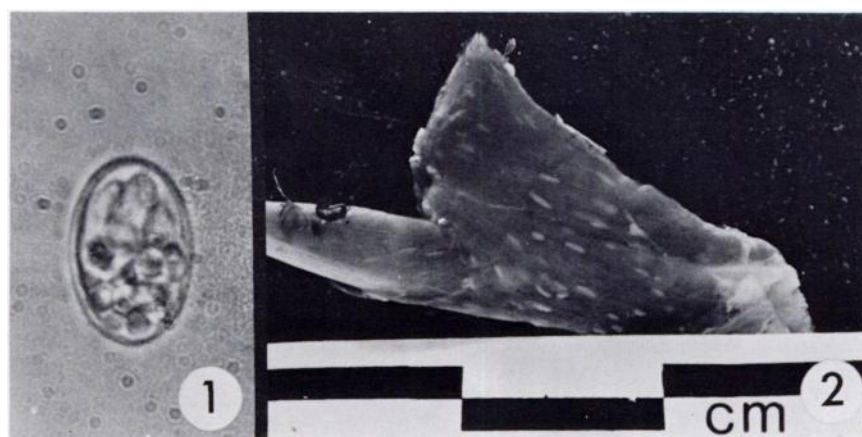
FIGURE 1. Single sporocyst passed by striped skunk fed muscle from a shoveler infected with Sarcocystis sp. The granular sporocyst residuum is concentrated at one pole; Portions of two of the four sporozoites are visible. Wet mount \times 1950 .