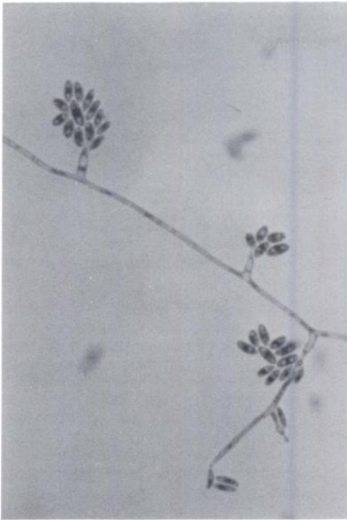
FIGURE 2. Microconidia of Fusarium oxysporum NVZC 8401 (from a red sea bream) produced on the tip of short monophialides. Cotton blue stain, \times 400 .

scribed by Booth (1971, The Genus Fusarium , Commonwealth Mycological Institute, Kew, Surrey, England, 237 pp.) (Figs. 1, 2).