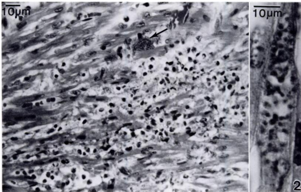
FIGURE 2. Myocardium of bobcat showing necrosis of myocardial fibers, infiltrations of leukocytes, and a group of T. gondii tachyzoites (arrow). H&E. Inset shows a group of tachyzoites within a myofiber. H&E.