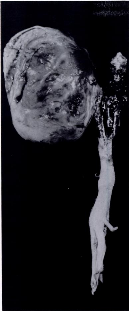
FIGURE 1. Pleomorphic sarcoma attached to medial epicondyle of the right femur of a hybrid mallard. \times 2 .

tion. Varying amounts of necrosis, fibrin, blood, and fibrous connective tissue were throughout the tumor. The tumor cells were characterized by extreme pleomorphism and prominent cell individualization. In most areas the cells had a rounded appearance (histiocytic) with