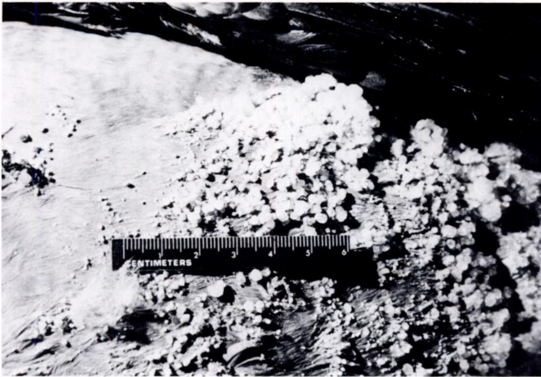
FIGURE 2. Salt accumulation on feathers of Canada goose that died of salt poisoning at White Lake, North Dakota.

and/or released after gaining access to fresh water, and (5) no evidence of other toxic, traumatic or infectious diseases.