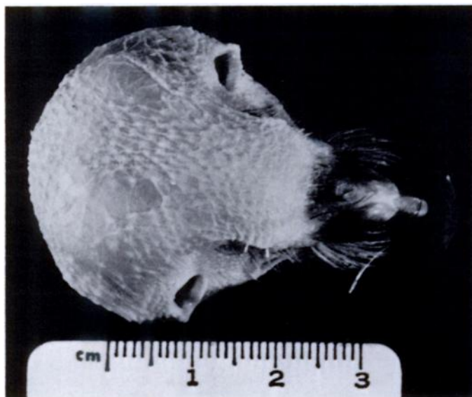
FIGURE 3. Head of screech owl with bilateral microphthalmia; the feathers have been removed. Note the small palpebral fissures and the caudal displacement of the eyelids due to absence of normal sized globes.

this manner probably would die and never be seen by human beings. Minor lesions might not result in significant loss of ocular function allowing the birds to live a normal life. If these birds were captured for reasons other than ocular dysfunction, these minor lesions might be overlooked. Moreover, some owls have been shown to be capable of locating prey items in absolute darkness using only auditory cues (Payne, 1971). This uncanny capability may lessen the impact of minor visual disturbances in this group of predatory birds. Even major lesions might not come to our attention if they were unilateral since it is clear that some raptors having the use of only one eye still can procure food and survive (Lord, 1956; Murphy et al., 1982; Buyukmihci, 1985; Murphy, 1987).