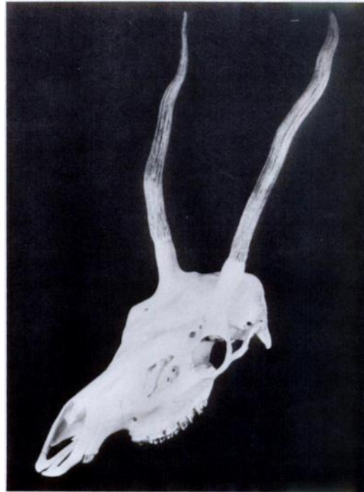
FIGURE 3. Photograph of skull showing bilateral corkscrew antlers in a yearling male tule elk that died at Point Reyes in 1979 (PORE 319).

In July 1979, the surviving adult male was emaciated, with its ribs and backbone severely protruding. The animal's hooves were badly overgrown and its pelage was pale and brittle. Its serum copper level was 0.3 parts per million (ppm). In May 1980, the animal had gained weight and its serum copper level increased 1.0 ppm. However, serum copper declined to 0.3 ppm again in July 1980.