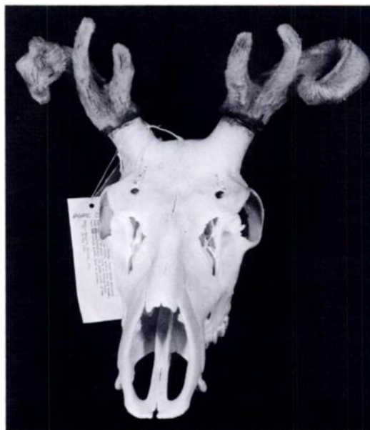
FIGURE 1. Photograph of skull showing bilateral deformed antlers of an adult male tule elk that died at Point Reyes (PORE 312).

Both mature males exhibited a similar pattern of antler anomalies. Antlers of the male that died in 1979 appeared normal in development of the proximal portion of main beam and brow and bez tines, but were then bilaterally malformed with an anterior deviation of the beam ending in a vertically oriented club (Fig. 1). This elk died in July, prior to the normal shedding of velvet. The more massive, cast, 1979–1980 antler (PORE 481) of the surviving male exhibited a sharp downward bend in the main beam beyond the bez tine and the distal portion of the beam was palmate from which four small tines protruded (Fig. 2). The 1980–1981 antlers of this male were more normal in appearance. Antlers for 1981–1982 were partially malformed and considerably smaller than those of the previous year. A radiograph of the cast antler from this mature male at Point Reyes in 1979 (PORE 481) showed a poorly developed cortex in comparison to the antler grown by the same male at Grizzly Island