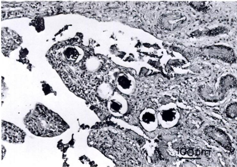
FIGURE 2. Schistosome eggs and mixture of inflammatory cells in the lamina propria of small intestinal villus of a tapir. H&E.

sum ( Didelphis virginiana ) (Kaplan, 1964), white-tailed deer ( Odocoileus virginianus ) (Davis and Liebke, 1971), and domestic dog (Malek et al., 1961; Pierce, 1963; Trasher, 1964; Feldman and Chester, 1968). Heterobilharzia americana , which utilizes snails such as Lymnaea cubensis or Pseudosuccinea columella as intermediate hosts, is found mainly in the Gulf Coastal region of the United States. The clinical signs and pathologic changes associated with a H. americana infection are similar to those described for Schistosoma mansoni infection in humans (Goff and Ronald, 1981). Schistosomal lesions are associated with the host's reaction to the eggs, which pass from the adult female in the mesenteric venous plexuses to the lumen of the intestines. During this process, the eggs infiltrate the intestinal wall, or are back-washed through the portal vein and lodged in the periportal tissues of the liver and other organs. Granulomas are formed around the eggs and subsequently progress