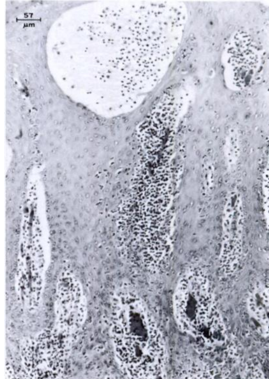
FIGURE 3. Perivascular infiltrates of the superficial lamina propria of the palatine mucosa of a white-tailed deer with malignant catarrhal fever. Lymphocytic infiltrates extend into the contiguous lamina epithelialis and are accompanied by epithelial degenerative changes and vesicle formation.

The inflammatory cell population contained smaller numbers of macrophages and occasional neutrophils in addition to the predominantly LC-LB populations. Infiltrates into deeper tissues and overlying epithelium, predominantly the stratum basale, were present. The latter was associated with widespread ballooning degeneration and necrosis, progressing to vesicle formation, of cells in the overlying stratum granulosum. Vesicles contained proteinaceous fluid, necrotic and degenerative cellular debris, and mixed inflammatory cell infiltrates. They were occasionally associated with full thickness epithelial necrosis and ulceration. Moderate widespread cellular infiltrates, edema, and vasculitis of the abomasal lamina propria mucosa, submucosa and subjacent tunica