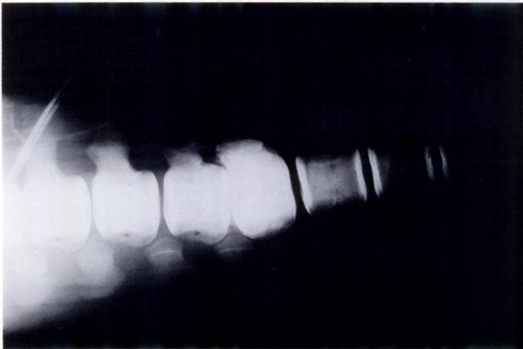
FIGURE 3. Radiograph of the posterior lumbar spine of an Atlantic bottlenose dolphin 4 mo posttreatment. Although the disk space has remained collapsed there has been no further extension of the disease process as compared to Figure 2.