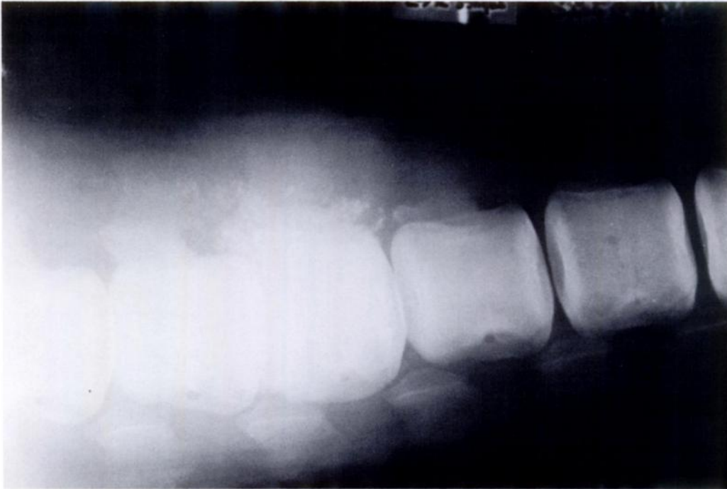
FIGURE 2. Radiograph of the posterior lumbar spine demonstrating a sclerosis of the vertebral bodies, collapse of the intervertebral disk space and periosteal new bone formation in an Atlantic bottlenose dolphin.