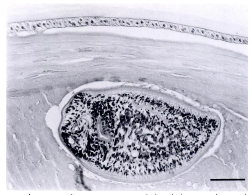
FIGURE 1. Diplostomum spathaceum metacercariae in the lens of a longnose sucker. Note liquefaction in the lens fibers adjacent to parasite. H&E. Bar = 100 \ \mu m.

relation between the parasite intensity and the age of the fish.