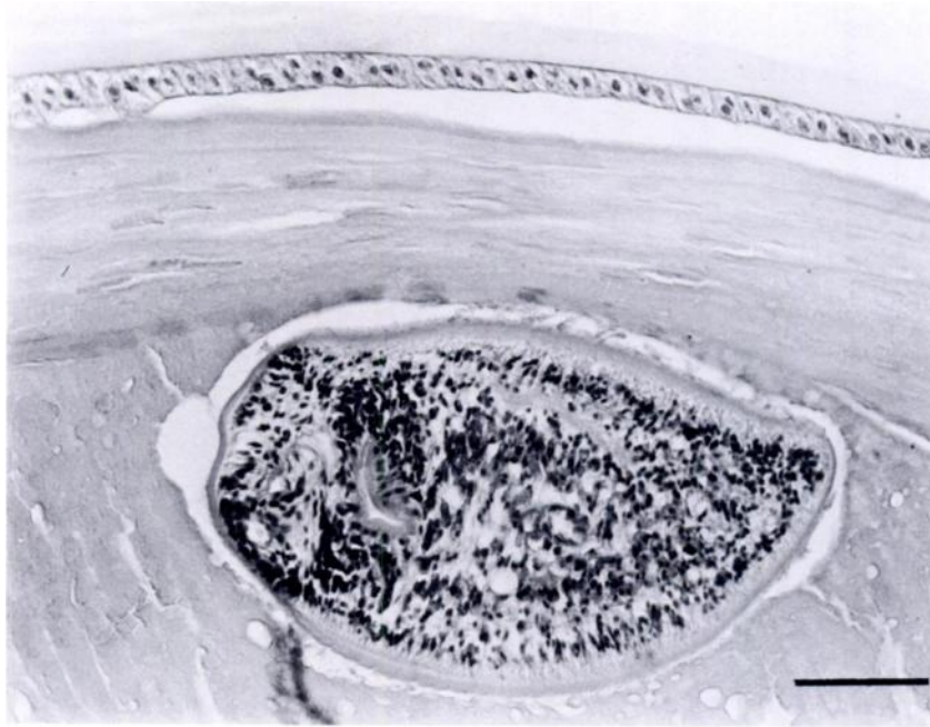
FIGURE 1. Diplostomum spathaceum metacercariae in the lens of a longnose sucker. Note liquefaction in the lens fibers adjacent to parasite. H&E. Bar = 100 \mu m.

relation between the parasite intensity and the age of the fish.