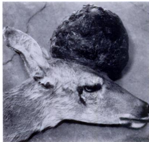
FIGURE 1. Large osteochondroma protruding from the skull of a white-tailed deer.

The bony mass involved the left frontal bone with extension into the cranial cavity causing indentation of the left cerebral cortex (Fig. 2). The left zygomatic arch was destroyed, a bony protrusion extended into the socket of the left eye, and there was focal involvement of the squamous temporal bone and mastoid process. The