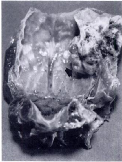
FIGURE 2. Extension of the osteochondroma (arrow) into the cranial cavity of a white-tailed deer.

cut surface of the mass contained areas of hemorrhage, necrosis, dense bone and fine bone spicules. Other organs in the deer appeared grossly normal.