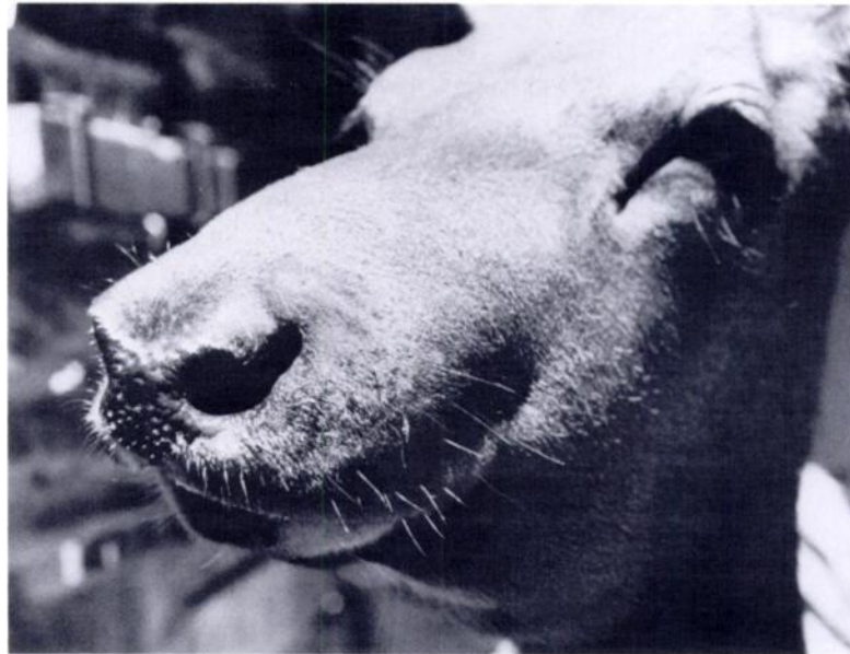
FIGURE 1. Captive elk showing signs of relatively severe reaction to prairie rattlesnake bite, characterized by facial swelling, submandibular edema, epiphora and epistaxis.

and blood-tinged, frothy nasal exudate were seen in one of these cows (D86).