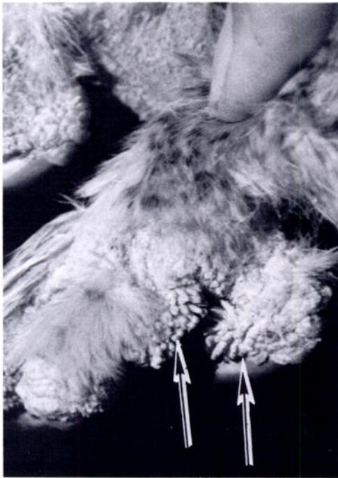
FIGURE 2. Gross skin lesions on the plantar surface of the foot of a great-horned owl showing proliferative papillary hyperkeratosis.