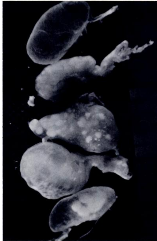
FIGURE 1. Gall bladders from Peromyscus maniculatus . Conditions illustrated from top to bottom are no gall stones present, compacted with gall stones of similar size, partially filled with gall stones of various size, filled with cholesterol sheet and many small gall stones, filled with several large (approximately 1 mm) gall stones.

The data on monthly numbers of each age and sex of mice examined and gall stone prevalence is presented in Table 1. A significant ( P < 0.05 ) sex-related difference in gall stone prevalence occurred only once in the adult deer mice during the 36 consecutive months of this study (October 1987, \chi^2 = 4.26 , df = 1 , P < 0.05 ) and twice in the subadult age class (March 1986, \chi^2 = 4.35 ; and May 1986, \chi^2 = 6.24 , df = 1 ). In each case gall stone prevalence