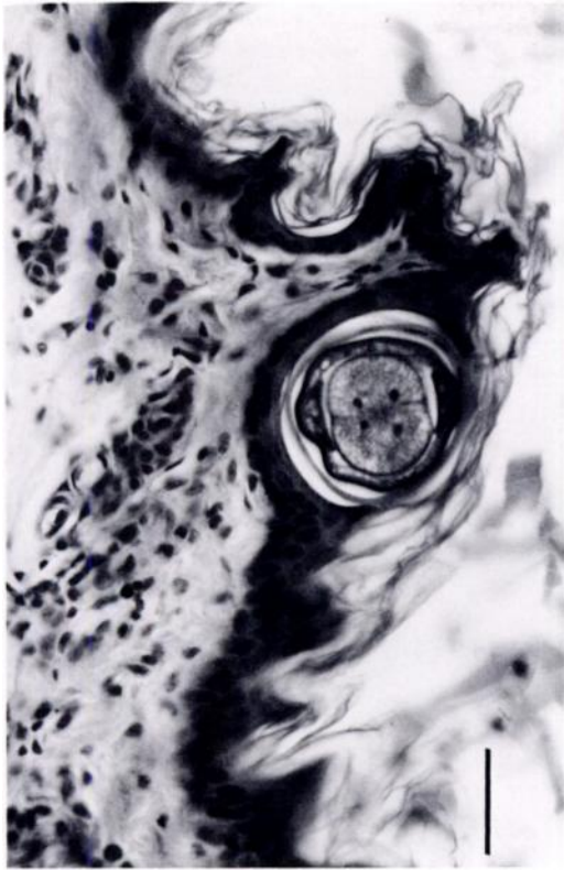
FIGURE 1. Fourth-stage rhabditoid larva (?Cylindrocorporidae) in the skin of a platypus (Animal four); the parasite is enclosed within stratum corneum. There is mild infiltration of the dermis by lymphocytes, with small numbers of plasma cells and eosinophils and there is a diffuse, mild, orthokeratotic hyperkeratosis. H&E. Bar = 50 \mu m.