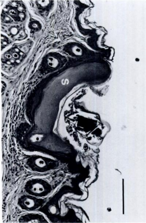
FIGURE 3. Trombiculid mite lying on the epidermis of a platypus (Animal one). Note the amorphous eosinophilic gel saliva (S). H&E. Bar = 100 \mu m.