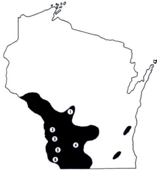
FIGURE 1. Map of Wisconsin showing hunter-check stations where blood samples from wild turkeys were obtained, 1983–1984. Shaded area indicates range of wild turkeys in Wisconsin. Study sites include (1) Necedah, Juneau County; (2) Romance Tavern, Vernon County; (3) Gays Mills, Crawford County; (4) Tower Hill, Iowa County; (5) Boscobel, Grant County; (6) Cassville, Grant County.

Beginning 1 wk postinoculation, blood smears were made twice weekly for 6 to 9 wk, and were stained with Giemsa's stain at pH 7.2 to 7.3 (1:10 dilution for 1 hr). A minimum of 20,000 erythrocytes were examined per slide using oil immersion optics (1,250×). Erythrocyte numbers were estimated by counting the number of erythrocytes in ten random fields per slide, taking the average, and then counting the number of fields observed until a minimum of 20,000