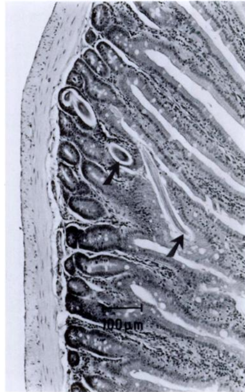
FIGURE 3. Small intestine from a cotton rat; note fragments of migrating larva (arrows) of Strongyloides sp. within the small intestinal crypts. H&E.

small body diameter (21 to 42 \mu\text{m} ) and darkly stained ovaries and ova (Fig. 1). Diagnosis was supported by their intense staining capacity, size of ova, site of infection and frequent presence of eggs in cross sections (Chitwood and Lichtenfels, 1972). A moderate inflammatory response to the larvae of Strongyloides sp. characteristically included atrophic villi, moderately hyperactive crypts, epithelial hyperplasia and infiltration with lymphocytes, plasma cells, and eosinophils in the lamina propria (Fig. 4). Occasionally, the crypt lumina contained degenerate, necrotic sloughed epithelial cells. In mild inflammatory responses, changes in the villi and crypts of Lieberkuhn, including infiltration with lymphocytes and plasma cells in the lamina propria, were minimal. Submucosa and serosa of the small intestine essentially were normal. Microscopic