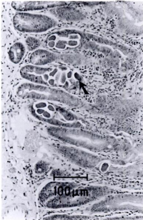
FIGURE 4. Moderately hyperactive crypts and infiltration of mononuclear cells and eosinophils through lamina propria of small intestine of a cotton rat with Strongyloides sp.; note embryonated egg within the crypts (arrow). H&E.

hosts, including hamsters, guinea pigs, white rats, mice and rabbits, with subcutaneous injections of large numbers (1,000 to 1,200) of filariform larvae. They were unsuccessful at infecting these potential hosts, concluding that S. sigmodontis is host-specific for the cotton rat.