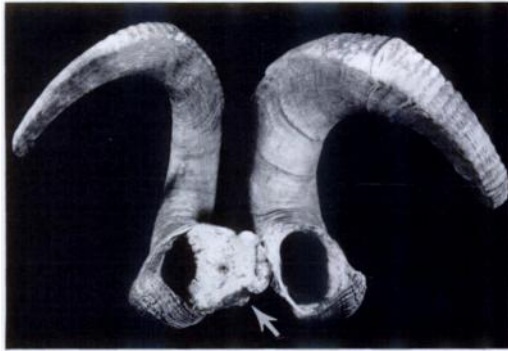
FIGURE 4. Loss of bone at the base of the left horn was followed by abnormal growth of the horn sheath (arrow).

Actinomyces pyogenes was isolated from exudates of Dall sheep rams with mandibular osteomyelitis (Glaze et al., 1982) and from desert bighorn sheep with chronic sinusitis (Bunch et al., 1978). Actinomyces spp. is common in North American wild sheep and may have been the organism that infected the left horn of this Dall ram.