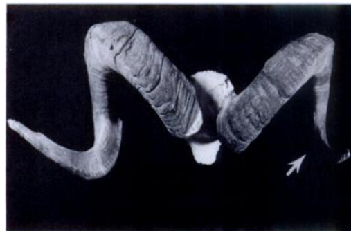
FIGURE 1. Asymmetric growth of left horn (arrow) in a Dall ram.

The right cornual process and sheath appeared normal. Based upon visual characteristics, the abnormal growth of the left horn appeared to be due to chronic epidermitis and osteomyelitis of the cornual process (Fig. 2). Caudal and lateral aspects of the cornual process and the flattened portion of the base contained numerous pits and crevices 1 to 8 mm in diameter and 1 to 3 mm deep. There was a large cavity (20 mm in diameter and 10 mm