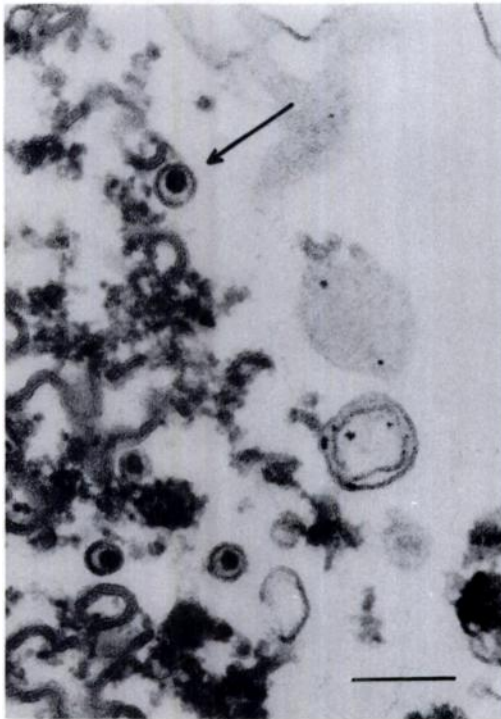
FIGURE 1. Electron microscopic images of the two pestivirus isolates from roe deer. Virus particles (arrow) in BVDV-free bovine embryonic lung cells are characteristic of pestiviruses. Bar = 200 nm.

exposed to BVD strains isolated from a cow in Schleswig-Holstein (54°04'N, 9°58'E). Slides with cells containing BVDV (strain NADL), and uninfected cells were used as positive and negative controls, respectively (Mayr et al., 1977).