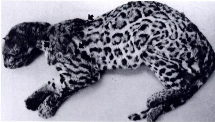
FIGURE 1. Carcass of a mature male ocelot from southern Texas infected with notoedric mange on the head, neck, shoulders, and forepaws. Note the line of demarkation between normal and infected areas (arrows) and the apparent emaciation.

malin buffered at pH 7.2. After fixation for 24 hr, tissue was embedded in paraffin; sections were cut at 4 to 6 \mu\text{m} , stained with hematoxylin and eosin and mounted on glass slides. Mites were examined as whole mounts in Hoyer's medium (Krantz, 1971) and identified according to the description in Pence (1984). Specimens of N. cati from the ocelot are deposited in the U.S. National Museum and U.S. Department of Agriculture Acari Collection (Systematic Entomology Laboratory, U.S. Department of Agriculture, Agriculture Research Service, Beltsville, Maryland, USA).