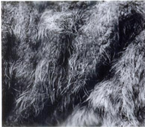
FIGURE 2. Lesions of notoedric mange on the neck of an infected ocelot; note thickened wrinkled gray skin encrustations and marked alopecia.

There was a serosanguineous nonpurulent pleural and peritoneal effusion. The stomach was empty. Except for numerous small granulomatous lesions in the stomach, the remainder of the gastrointestinal tract appeared normal; the posterior small and large intestines contained formed fecal masses consisting mostly of rodent bones and hair. Because of the low species richness and intensities, helminth infections were considered incidental; these results will be reported elsewhere.