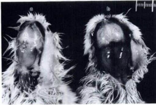
FIGURE 1. Pipping muscle. A control embryo is shown in Figure 1a; note less prominent pairs of pipping muscles with scant edema fluid. An oil-exposed embryo is shown in Figure 1b; note swollen dark pipping muscles with gelatinous material between the two muscle pairs and subcutaneous tissue. Scale is in mm.

cle fibers (Fig. 2). No edema or hemorrhage were evident in breast and gastrocnemius muscles or heart, or in any muscle of control embryos. Mean pipping muscle wet weight and relative muscle weight (muscle weight/total body weight) were significantly ( P < 0.05 ) higher in oil-exposed embryos than in the control group during pipping (Table 4). The mean relative weight of pipping muscle was significantly ( P < 0.05 ) greater in oiled groups than in controls on day 18 of incubation, at pipping, at hatching, and at 5 days post-hatching (Table 4). Levels of serum CK were elevated in oil-treated embryos only at hatching (Table 5). The range of CK values was very wide in both groups. Subcapsular hepatic necrosis with mineralization observed in oil-exposed embryos in experiment 1 was also present in treated embryos in experiment 2 (Table 4). The lesions were still observable at the termination of the experiment, 5 days post-hatching.