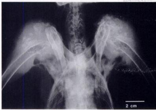
FIGURE 1. Radiograph of a ventrodorsal view of the great horned owl with lateral projection of the extended wings. Mineralized foci are distributed over an approximately 3 cm region near each shoulder and are more coalesced on the left side.